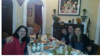
family visit in Virginia