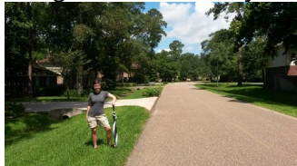
last look at nice Texas neighborhoods

locations, they will soon be teaching the message of Christ for the first time! We are very thankful that God allows us to be part of the work of bringing His message to people that would otherwise have no opportunity to know Christ.