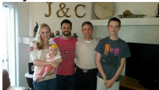
being with other family