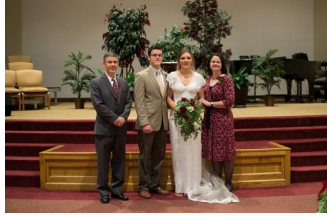
gaining a daughter