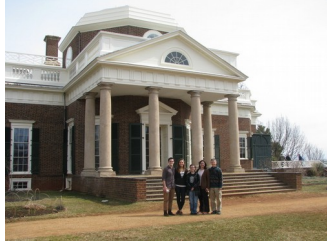
at TJ's home