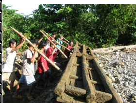
Moving the bridge back