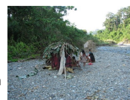
Tribal vacation home on the dry river bed