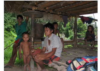
Family feeling dejected after their house burned down