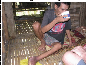
Man with the swollen foot