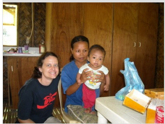
Giving our malaria treatments to adults and babies