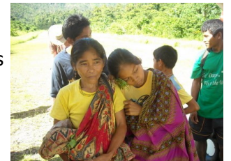
A patient sent out for treatment