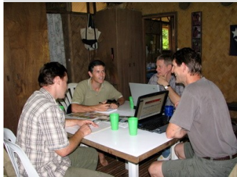
Consultants training us in language study techniques