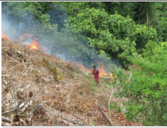
Burning the fields to prepare for planting