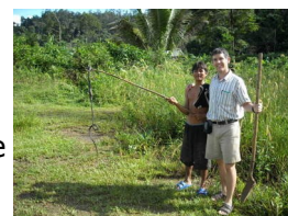
Holding up the dead cobra before throwing it out