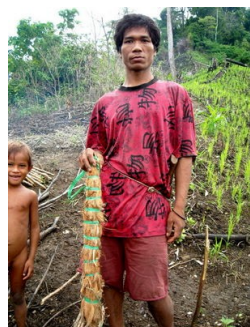
A bengkal is used to smoke out beehives

When they got close to our house, I asked him what was going on. "Oh, it's nothing, Ogsa! Just a little problem at my house, so we can't sleep there. I'll tell you about it tomorrow!" They didn't stop moving, continued to walk very fast, and pushed on past our house until they got to the village to stay the night in someone else's house. ( Ogsa means "cousin", and that is what they call us.)