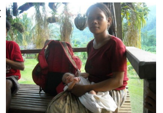
The mom and her baby that we took to the hospital