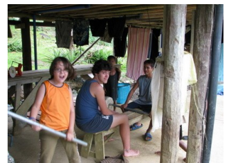
Our kids enjoying their tribal friends

So here we are! We are excited to get back cracking on language and culture study! It is really good that our people are no longer afflicted by the terrible hunger that they endured from last year up until the harvest! We plan to continue our language and culture study, and continue to give medicine to those in need!